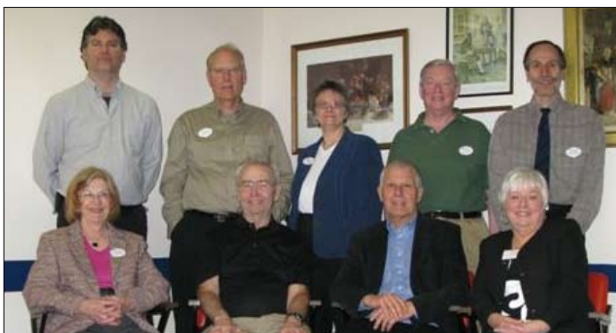
Viso Board of Directors